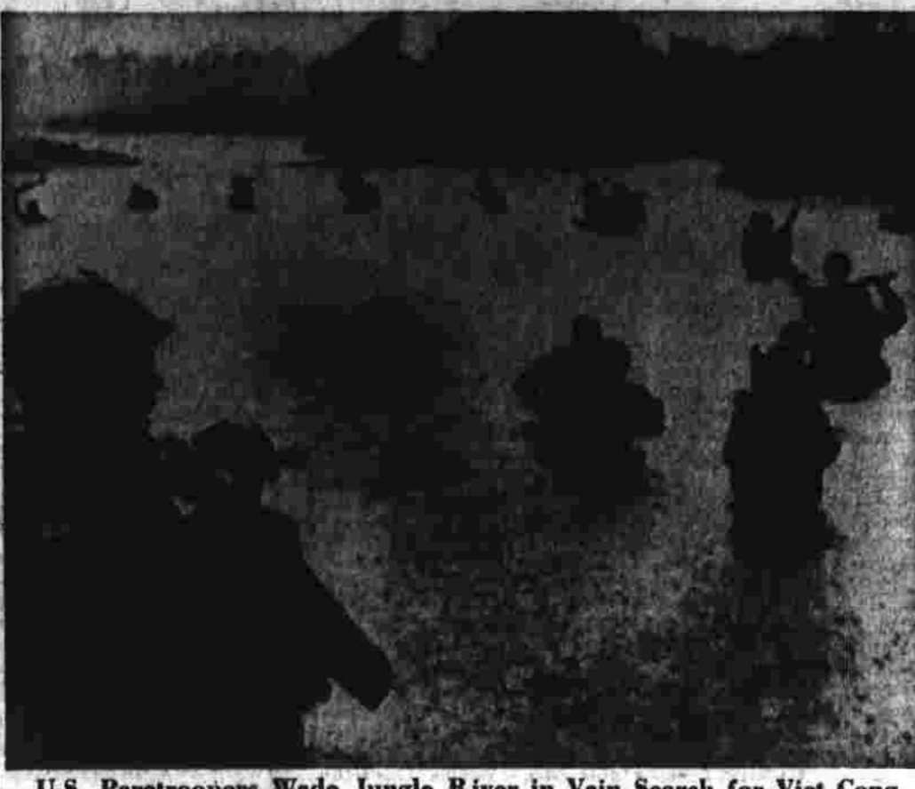
U.S. Paratroopers Wade Jungle River in Vain Search for Viet Cong

ROXBURY, Conn. (AP)—Playwright Arthur Miller has turned down an invitation to watch President Johnson sign the Arts and Humanities Act because the U.S. government has not answered a peace proposal from North Viet Nam.