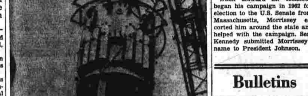
Sealab Elevator Reaches Top Floor

Ten aquanauts are inside this elevator—officially a Sealab personnel carrier—as it swings toward the deck of the staging vessel Berkone. The capsule brought divers up from the ocean bottom. Another group began residence in Sealab 2 yesterday.