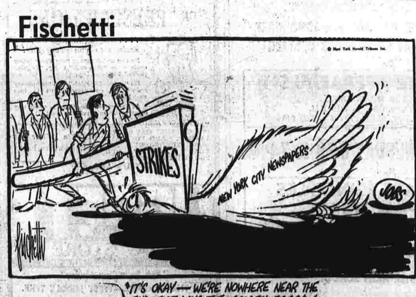
FISCHETTI IT'S OKAY—WE'RE NOWHERE NEAR THE END THAT LAYS THE GOLDEN EGGS