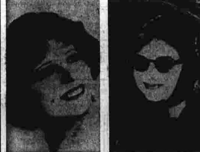
Famed "It Girl" Clara Bow is shown at the height of her popularity (left) and as she appeared a few years ago.

HOLLYWOOD (AP)—Clara Bow, legendary "It" girl of silent films but in recent years an insomniac-plagued recluse, died today of an apparent heart attack. She was 60.